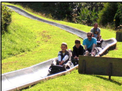
Our favourite ride at Woodlands dig-dig-dig-dig-ker-chung!!

Aviva was also looking for cost reductions and Mark was offered the option of moving to a 4-day week for 18 months. He started