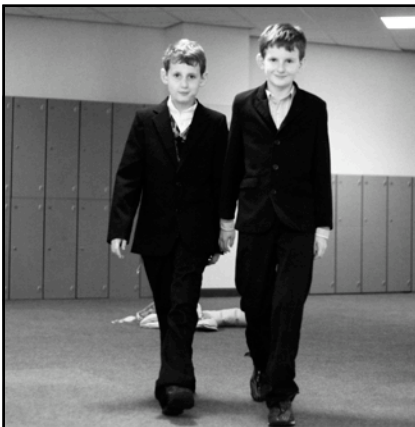
The boys are black in town!