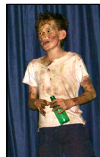
Let's all have a little drink!

In my second half term my bike was stolen but with the help of a boy in my form we got it back. It was ruined so I have a new one, like the old one, except it's not new because it's recycled - second hand from The Bike Project!