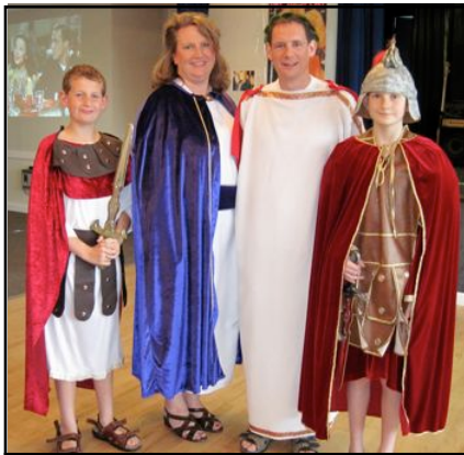
Glutimus Maximus with Paella & sons

"Absolutely Fabulous, sandals are so hot right now" – Gok Wan